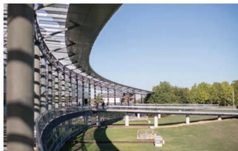
Northern campus Futuroscope