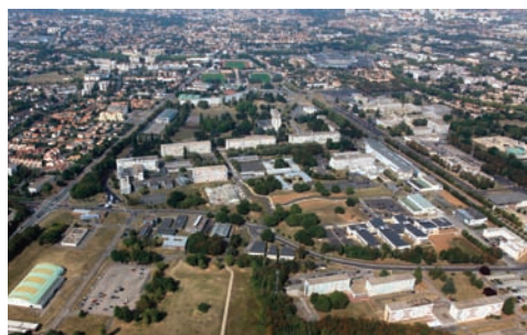
Southern campus Poitiers